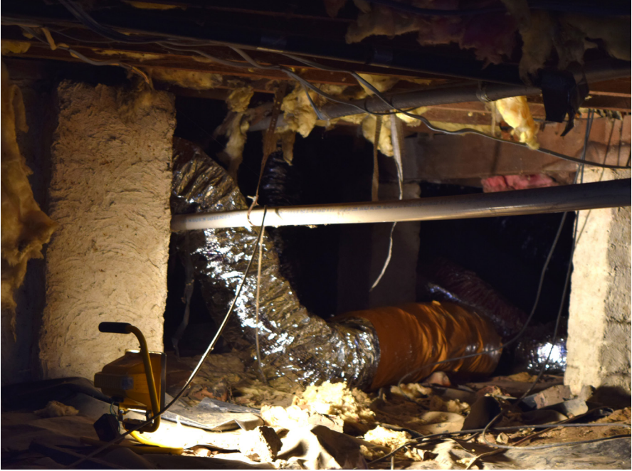
Above: Through KUB's low-income weatherization programs, problems like damaged ductwork and insulation are remedied, making homes more efficient and lowering energy bills.

This year, KUB, along with partners TVA, CAC, the City of Knoxville, and the Alliance to Save Energy and Socially Equal Energy Efficient Development (SEEED) received the Governor's Environmental Stewardship Award for Knoxville Partnerships for Low-Income Weatherization.