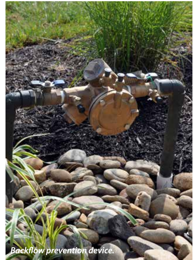
Backflow prevention device.

You can help protect the quality of our community's drinking water by using a backflow device to prevent cross-connection contamination.