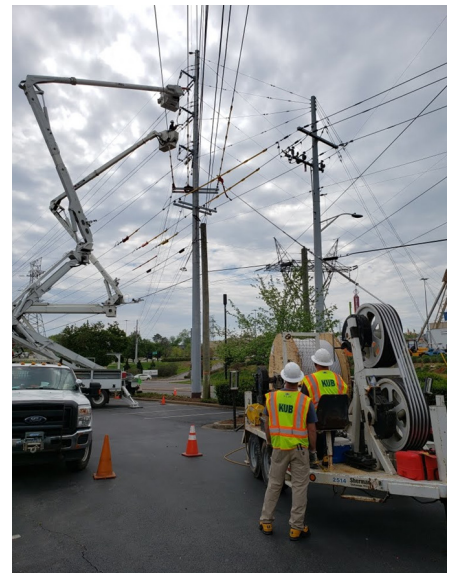
KUB crews install new overhead wires last week as part of electric system upgrades in the Morrell Road area.