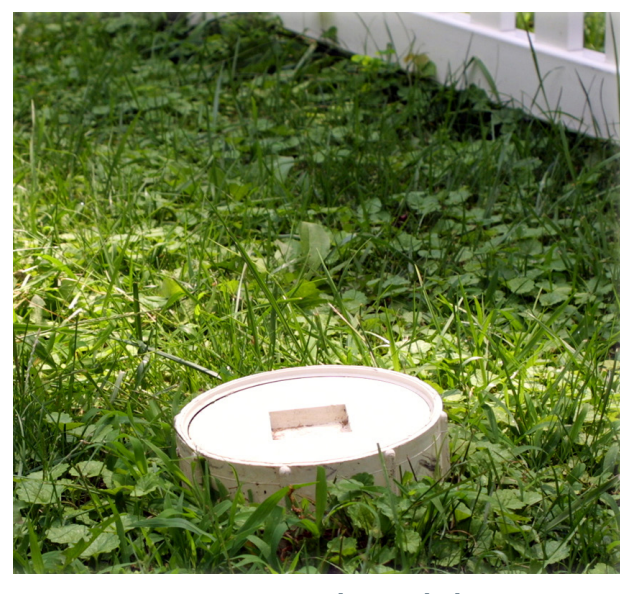
Sewer lateral cleanout cap