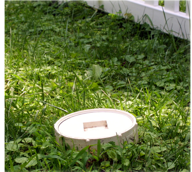
Sewer lateral cleanout cap