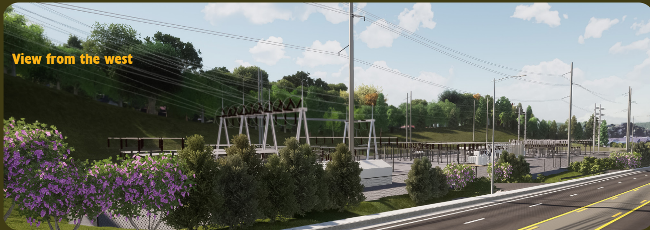
View from the west