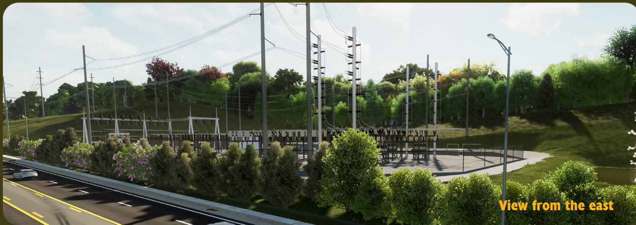
View from the east