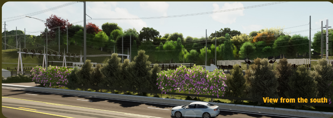
View from the south